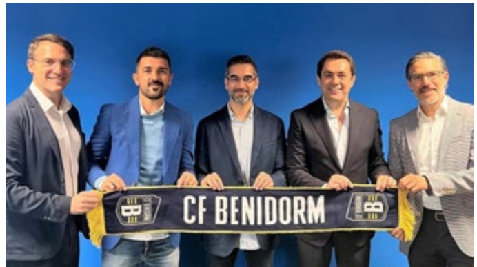
Atlético Benidorm CD and DV7 Group forged an agreement to unite, forming a club with strengthened resources