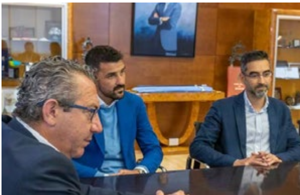
Mayor of Benidorm Toni Pérez highlights and blesses the amalgamation of a single Benidorm club

CF Benidorm's home matches are played at the Estadio Municipal Guillermo Amor, which has a capacity of over 9,000 spectators.